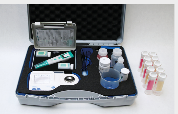
Test kit RSS refractometric measurement

We offer two test kits , each utilizing a different system for measuring the compound concentration.