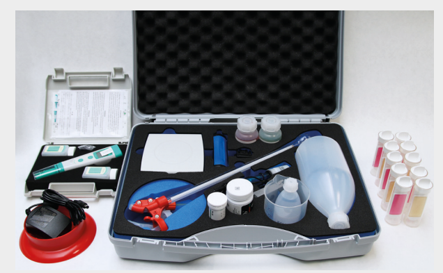
Test kit RSS titration measurement

For detailed information and a comprehensive consultation please get in touch with your direct contact at Rösler or send an E-mail to info@rosler.com .