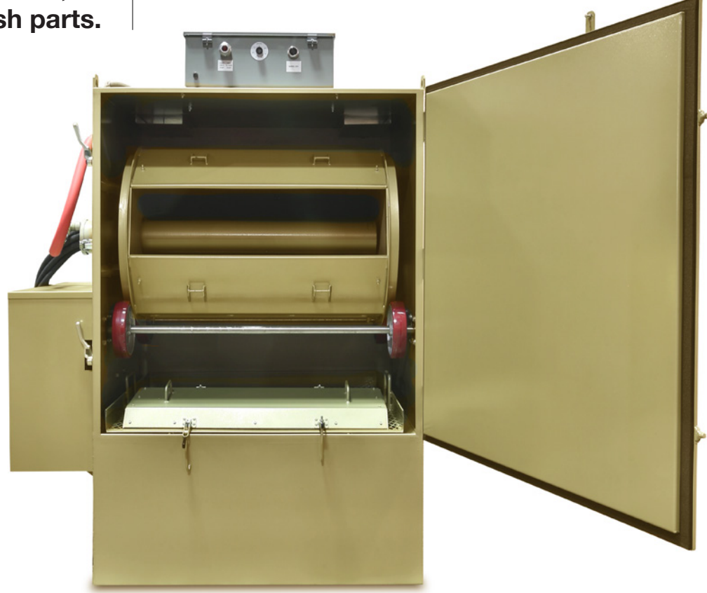
BNP-166 Tumble Barrel