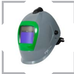
Z3® (NIOSH markets only.)