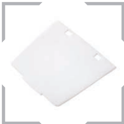
Pre-Filter (pk 10)