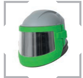
Nova 3® (CE markets only.)