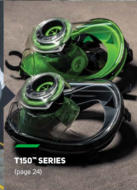
T150™ SERIES (page 24)