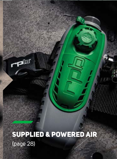
SUPPLIED & POWERED AIR (page 28)