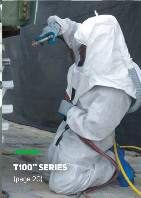
T100™ SERIES (page 20)