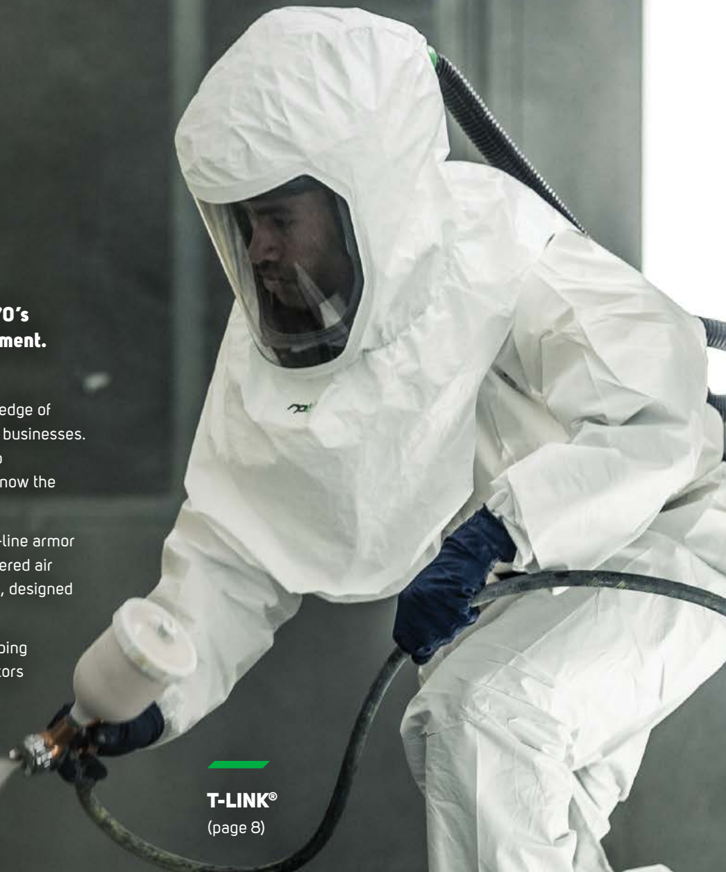
T-LINK® (page 8)