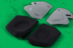
COMFORT-LINK™ Padding system.