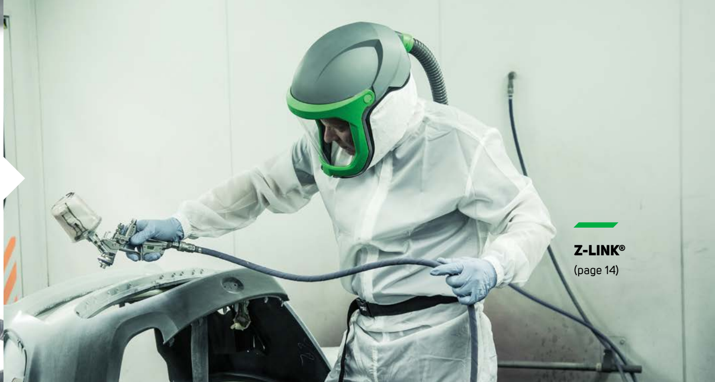
Z-LINK® (page 14)