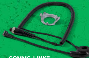
COMMS-LINK™ In-helmet communication system.