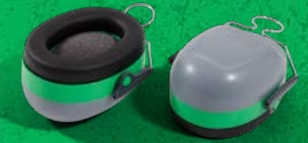
QUIET-LINK™ Ear defender system.