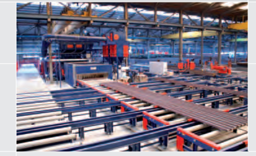
Complete Preservation Line