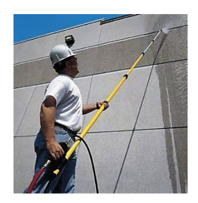
Exterior Building Surfaces