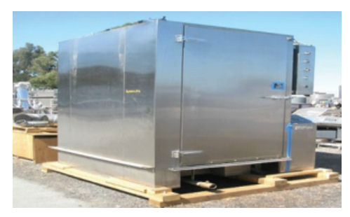
For General Industrial