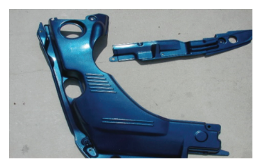
For Powder Coating

For: General Industrial, Automotive, and Architectural job shops and manufacturers.