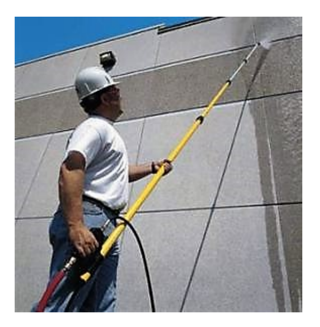
Exterior Building Surfaces