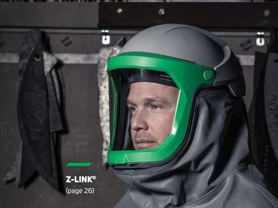
Z-LINK® (page 26)