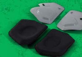
COMFORT-LINK™ Padding system.