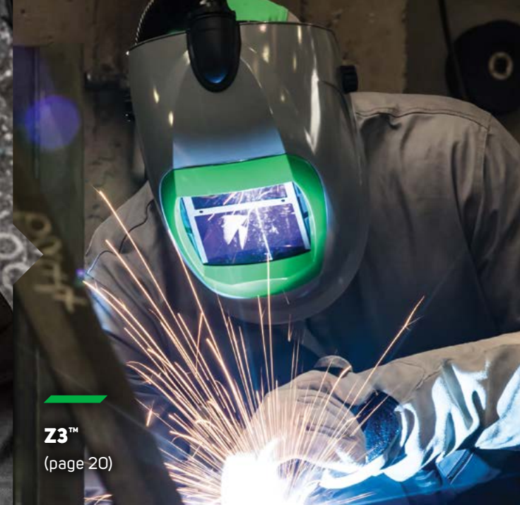
Z3™ (page 20)