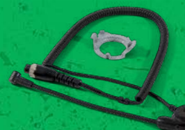
COMMS-LINK™ In-helmet communication system.