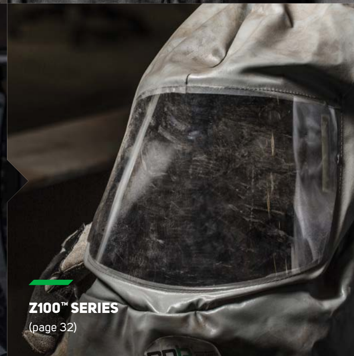
Z100™ SERIES (page 32)