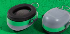
QUIET-LINK™ Ear defender system.