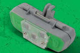
VISION-LINK™ Helmet lighting system.