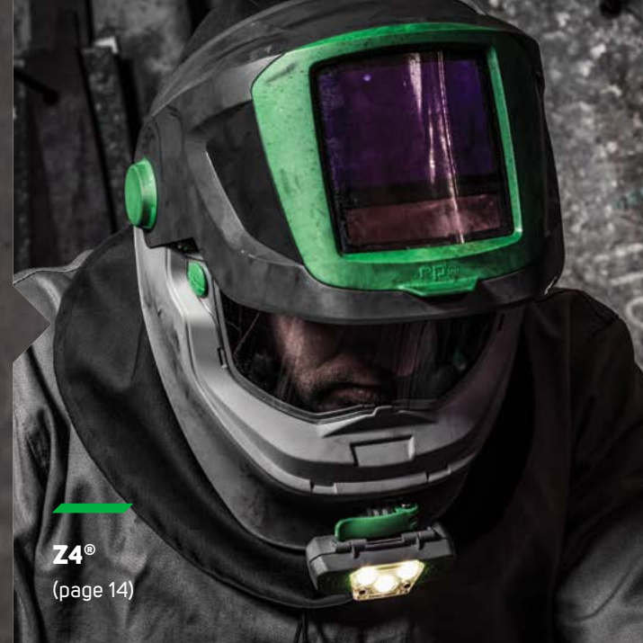
Z4® (page 14)