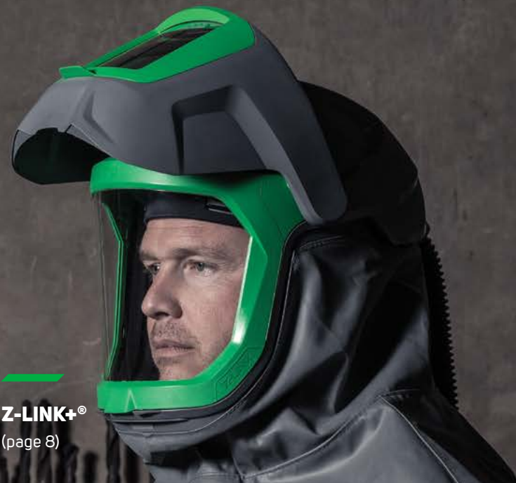
Z-LINK+® (page 8)