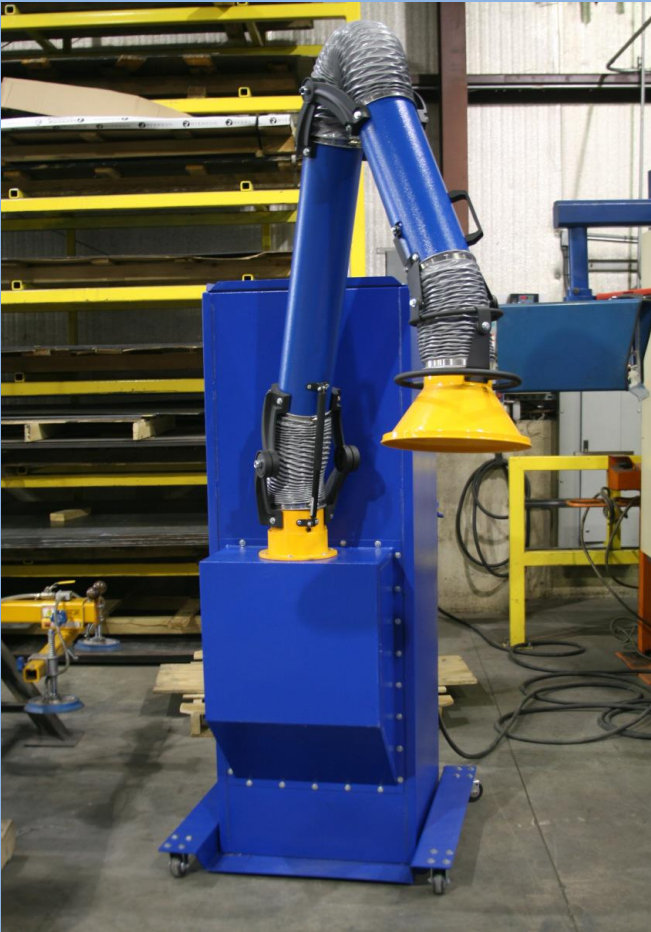
AT-Flex with Optional Arm and Castor Wheels. Made in the USA