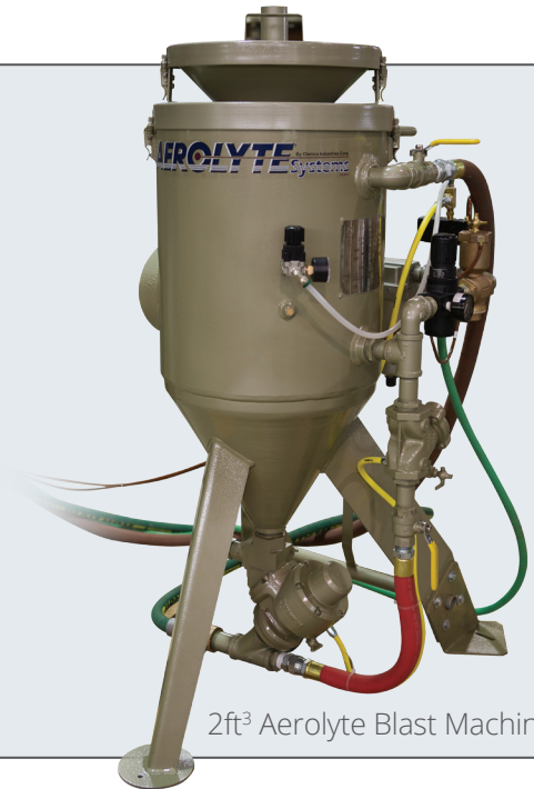
2ft 3 Aerolyte Blast Machine