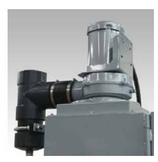
The "ZXX" Configuration