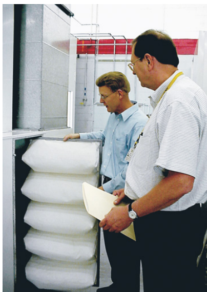
Air make-up bag filter

Depending on your paint booth setup, your first line of filtration defense may be air make-up filters.