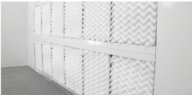
Exhaust filters on wall

Where intake filters ensure that you are working with clean air from the start, exhaust filters make sure the air leaving your paint booth is safe for the environment, while also keeping potentially dangerous chemicals from remaining in the airflow of the booth. Exhaust filters capture solid and liquid aerosols that painters can be exposed to through inhalation or dermal adsorption. The filters also keep those highly toxic materials from being released into the environment after passing through the booth.