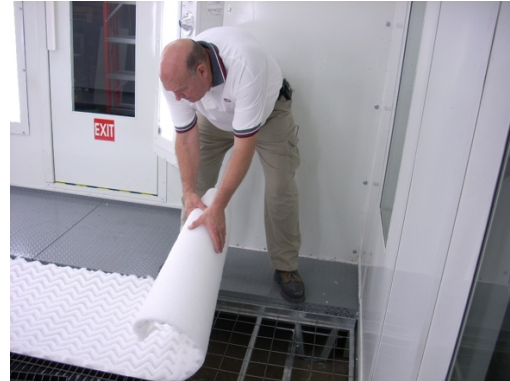
Exhaust roll media for pit

Most paint booths typically use single-stage filters. The type of exhaust filter used is the same for crossdraft and downdraft booths, but the location and frame configuration differ. In crossdraft booths, there are plenum or wall filters, whereas in downdraft booths, exhaust pit filters are used.