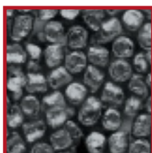
G1 conditioned (CCW)