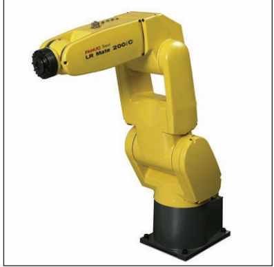
FANUC LR Mate 200 iC